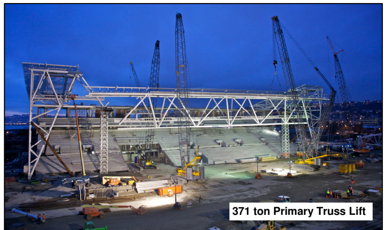
371 ton Primary Truss Lift